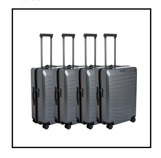
4 X TROLLEY M