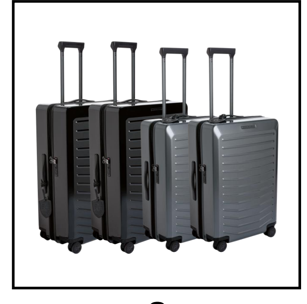
2 X TROLLEY M