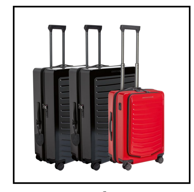
1 X TROLLEYS