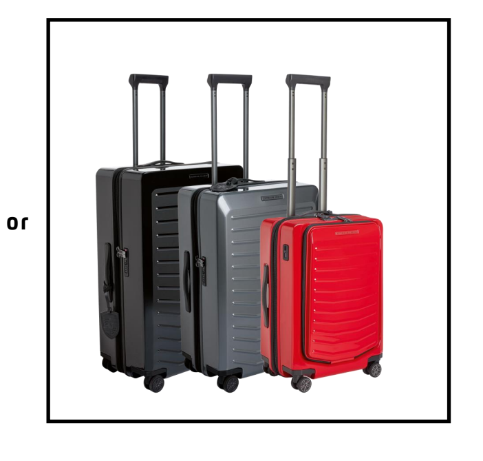
1 X TROLLEY S + M + L