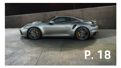
911 (992) / TURBO