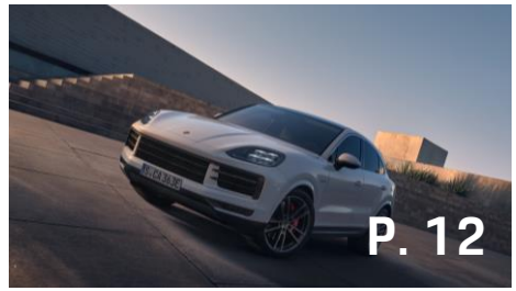
CAYENNE COUPÉ E-HYBRID