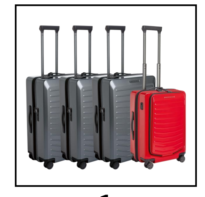
1 X TROLLEYS