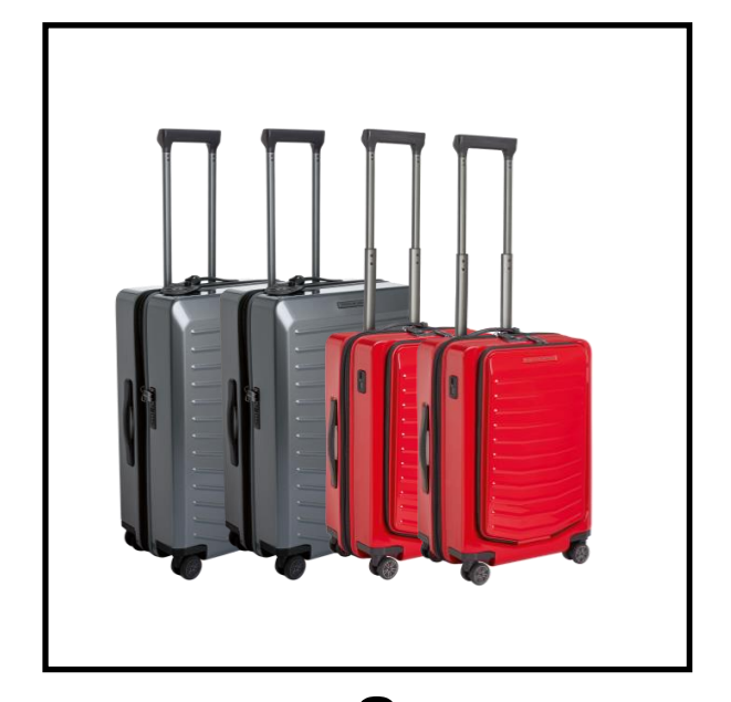
2 X TROLLEY S