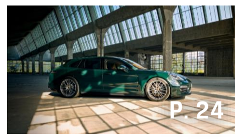
PANAMERA / SPORT TURISMO