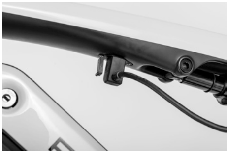
The charging process starts automatically.

Figure 7: Charger cable connector and drive battery.