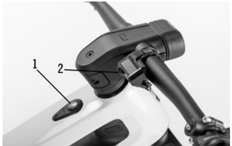
Figure 5: On/off button (1) and display button (2)

When the eBike is stationary, pressing and holding the display button (2) for around two seconds allows you to access the settings menu and select items from the menu.