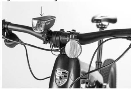
Figure 58: Front light

The rear light is fitted at the bottom of the seat post.