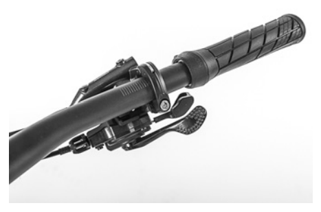
Figure 24: The position of the shifting lever (electronic)