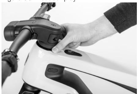
Figure 36: Headset play

A loose headset can increase the stress on the bearing and the front wheel fork. As a result, these components can break. Check the headset play regularly.