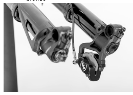
Figure 64: Transport guard for the disc brakes

Risk of damage to the eBike (brakes, rear triangle and front wheel fork) when transporting it with the wheels removed. Fit the transport guards for the disc brake. Do not operate the brake lever. Fit the spacers for the rear triangle and front wheel fork.