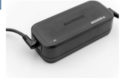
Figure 26: Overview of the indicator lights.

Make sure that you read the instructions for the charger.