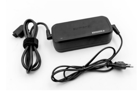
Figure 34: Charger

The drive battery must only be charged using the charger supplied with the eBike. If you use another charger, you could cause a fire or an explosion.