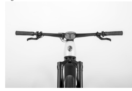
Figure 13: Front and rear brake levers.

In countries that drive on the left, the lefthand brake lever operates the rear brake and the right-hand lever operates the front brake.