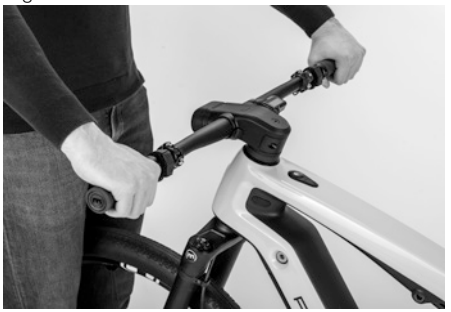
Figure 17: Handlebars and stem