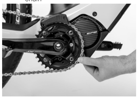
Figure 22: Checking the condition of the chain

Replacing your chain regularly can extend the life of your chain rings and cassettes. To check the condition of the chain, pull it away from the chain ring with your thumb and first finger. If you can pull the chain a long way away from the chain ring, it is stretched and needs to be replaced. Your ROTWILD authorised dealer can carry out a more accurate check of your chain using special tools.