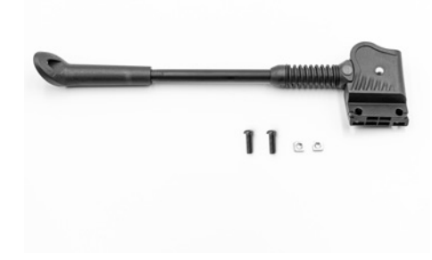
Figure 55: Side stand

Firstly, remove the cover from the stand mount on the left-hand chainstay.