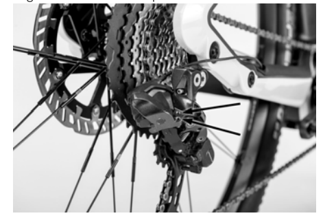
Figure 25: Limit stop screw

If you cannot adjust the gear shifting using this method, the system must be checked by the ROTWILD authorised dealer.