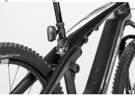
Figure 59: Rear light

Both lights are supplied with suitable bolts. These must be tightened to a torque of 4 Nm.