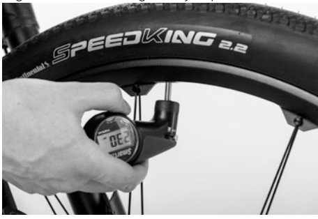
Figure 12: Checking the tyre pressure.

You should never let the tyre pressure exceed the maximum limit or fall below the minimum limit.