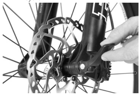
Figure 53: Fitting the Cross front wheel axle system

No tools are needed to remove the front wheel of the PORSCHE eBike Cross. Open the quick release lever on the axle and push the lightly greased axle through the hub until the thread engages with the dropout. Tighten the axle and apply the tension by turning the clamping lever upwards through 90°.