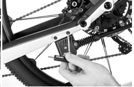
Figure 57: Fitting the stand

Fasten the stand in place from the outside with the two M6x16 bolts supplied. Please note that the tightening torque is 4 Nm.