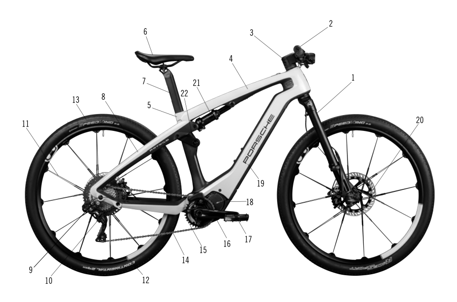
Figure 4: Detailed information about the PORSCHE eBike