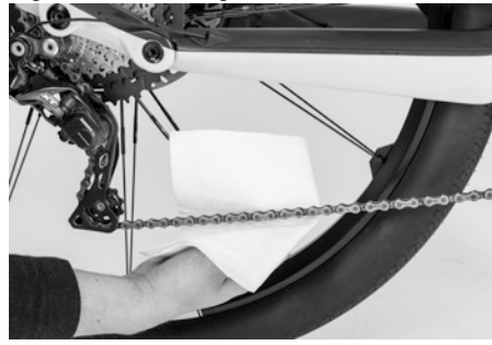
Figure 20: Cleaning the chain

The drive system must be completely switched off during maintenance and repairs to ensure that an accident does not occur. To switch off the system, remove the drive battery.