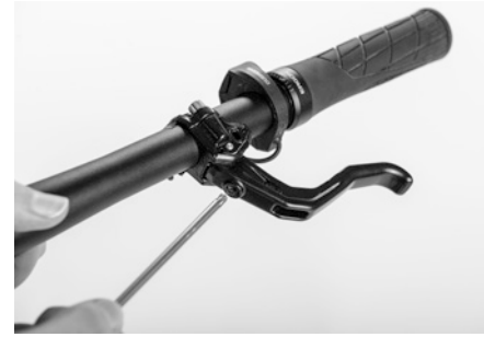
Figure 19: Brakes / grip width

If the brake lever cannot be adjusted or is not safe, it must be checked by the ROT-WII D authorised dealer.