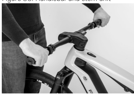
Figure 35: Handlebar and stem unit

Make sure that the handlebar and stem cannot be turned in opposite directions by clamping the front wheel between your knees and trying to turn the handlebars.