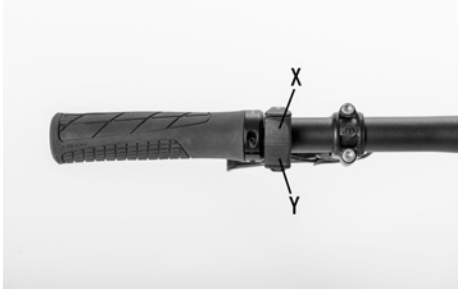
Figure 6: Support switch (X/Y)

At a higher support level, the electric drive delivers higher torque. In the lowest support level, no additional torque is delivered and the EPAC is operated by pure muscle power.