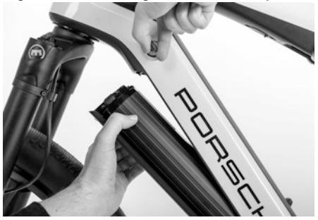
Figure 31: Removing the drive battery