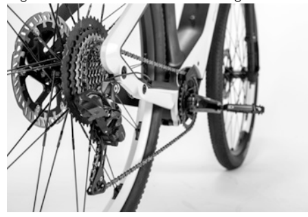
Figure 18: Chain on the chain ring/cassette

Check that the chain is on the front chain ring and the rear cassette. If the bike fell on the dérailleur side, damage may have been caused. Try shifting through the gears and make sure that the rear dérailleur and/or the dropout, which could be bent, are not too close to the spokes of the rear wheel.