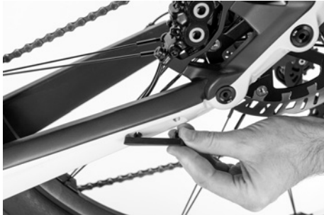
Figure 56: Stand cover

To fit the stand, position it on the inside of the chainstay in the slot intended for the purpose.