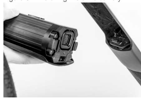
Figure 32: Installing the drive battery

Finally, secure the drive battery in the down tube. To do this, put the key in the lock cylinder on the drive battery holder at the top end of the down tube on the left-hand side of the frame and turn it clockwise.