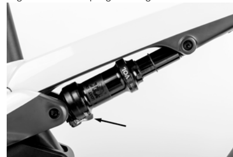
OPEN, MEDIUM, FIRM.