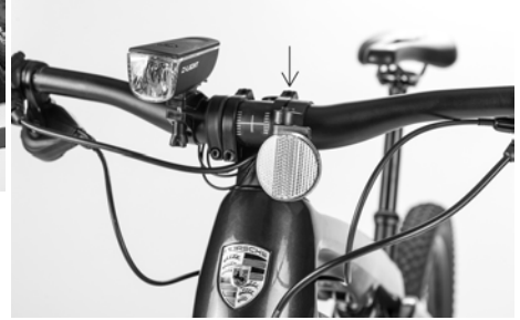
Figure 62: Fitting the front reflector

The front light is fitted on the handlebar to the left of the stem.