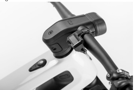
Figure 3: ON/OFF switch