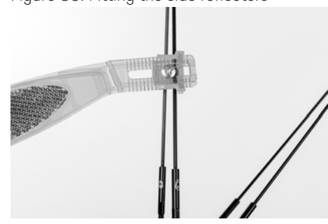
Figure 60: Fitting the side reflectors

Put the rectangular yellow reflectors on the inside of two spokes and press the orange clips onto the reflectors from the outside so that the reflectors are fastened to the spokes.